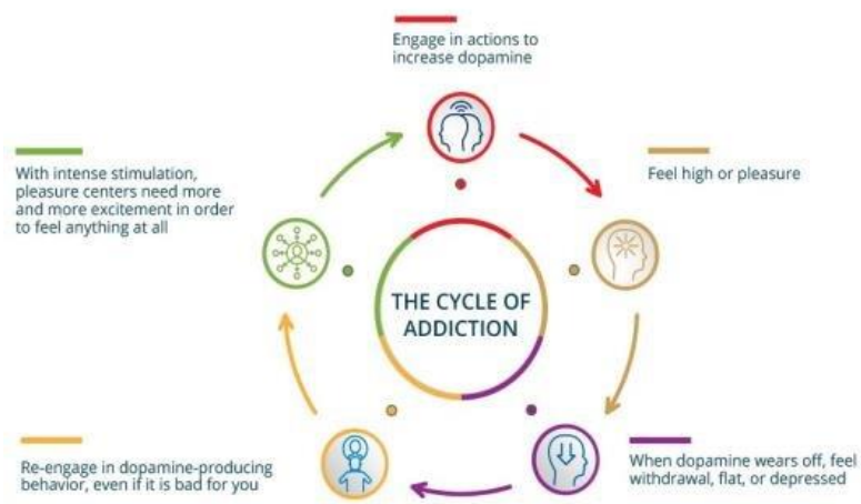
Figure 1: (4)

Following our exploration of novel cessation strategies, we delve into the realm of early oral cancer screening, a crucial aspect of preventive healthcare. We discuss the